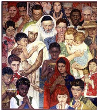
The Norman Rockwell Mosaic was presented on the occasion of the 40th anniversary of the United Nations in 1985, by Mrs. Nancy Reagan, the then First Lady, on behalf of the United States.

Please come to the St. James Annual Meeting. Feb 8th, after the 10 am Service in St. James Hall.