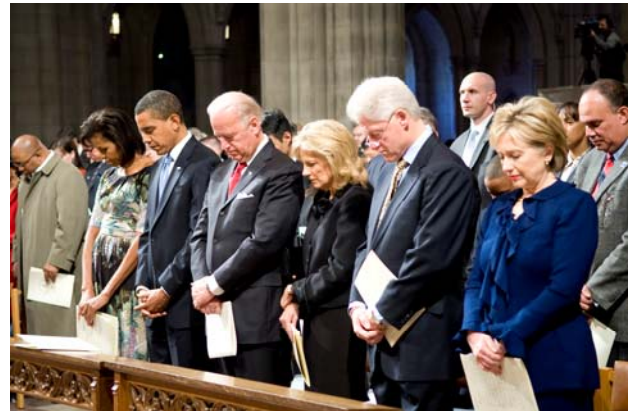
Eleanor's view from her pew in the National Cathedral!

Since details of the day have been covered in all media, and my sermon given the first Sunday after the Inauguration included some highlights about the Inauguration and the Inaugural Prayer Service at the Washington National Cathedral, I will share a few personal reflections from the experience: